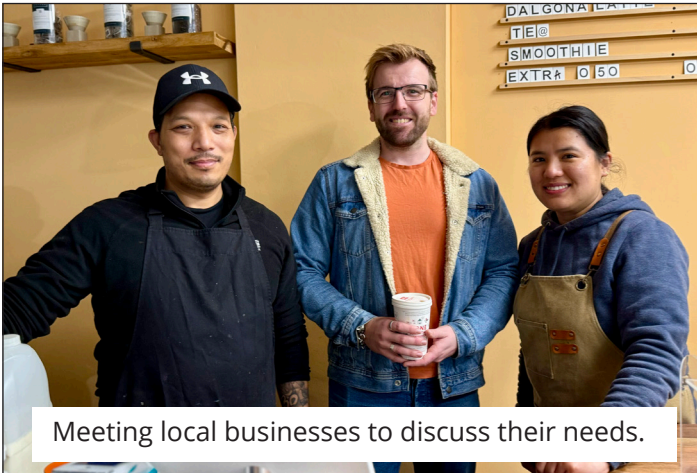
Meeting local businesses to discuss their needs.

The Celebration Mile is not doing this for our Town. I have spoken with many small businesses on this issue and everyone except Councillors think it's a bad idea. Bridgwater needs more community gathering places and attractions. Sadly, the Celebration Mile does none of this.