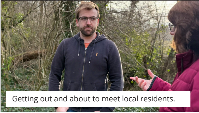
Getting out and about to meet local residents.

Bower and Bridgwater itself is long overdue a Councillor on their side with a stance that puts Bridgwater first over greed and political pressure. I will be that candidate for you.